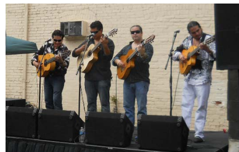
NCMS's 3rd Annual Art Walk was held on August 6, 2011.