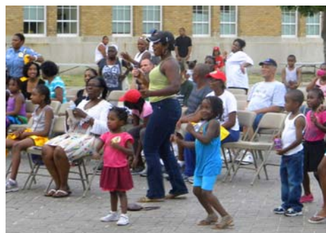
National Night Out was celebrated across the District on August 2, 2011. The 5D kickoff was held at CAPS in Ward 5's Truxton Circle neighborhood.